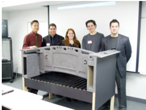
Third place winners with their Bed Divider System – Ford F150