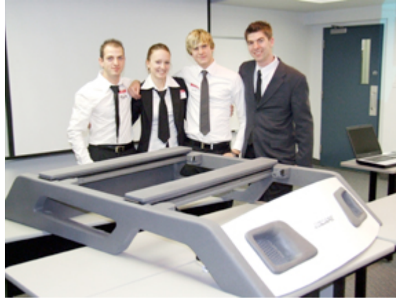
Second place winners with their Roof Rack – Ford Escape